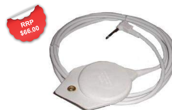
A-SL-PRESSURE-PEND-TR A-SL-PRESSURE-PEND-TS A-SL-PRESSURE-PEND-MONO

Stereo 6.35mm right angle plug- tip and ring.