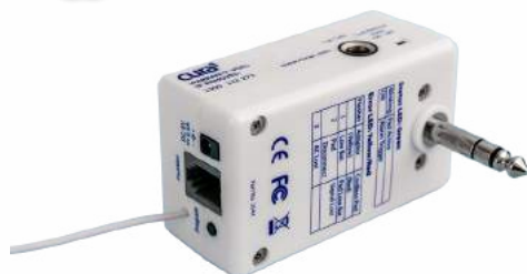
A-CL-MULTIPORT (Facility use only)