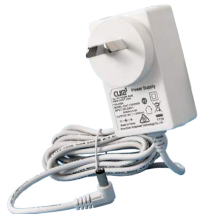
A-CBM & BME-PP