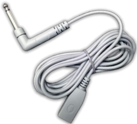
A-BREAKCORD-USB - T & R OR A-BREAKCORD-USB - T & S