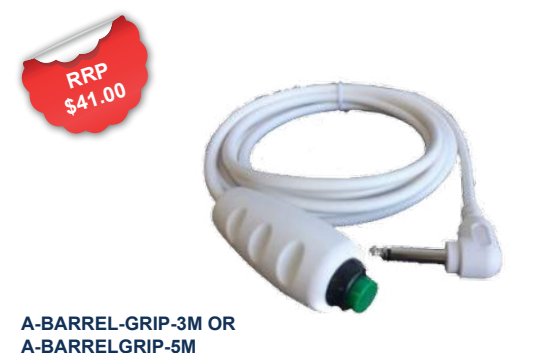
A-BARREL-GRIP-3M OR A-BARRELGRIP-5M

Our standard connection is mono 6.35mm - If you require a different connection please advise our sales team