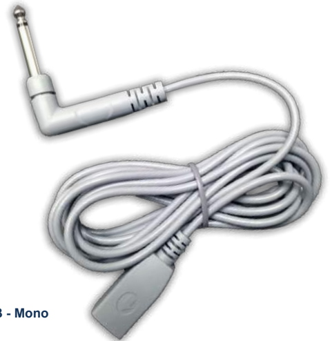
A-BREAKCORD-USB - Mono (Our standard)