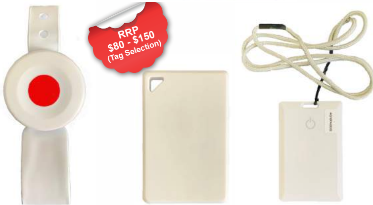
A-SAFELIFE WRIST, CLOTHING & ASSET TAGS