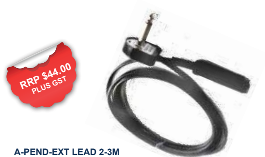
A-PEND-EXT LEAD 2-3M

Our standard connection is mono 6.35mm - If you require a different connection please advise our sales team