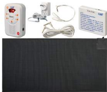
A-MAXI CL KIT