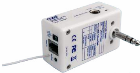
A-CL-MULTIPORT (Facility use only)