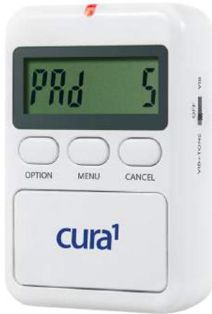
A-ACTIVECARE-PAGER (Home Care)