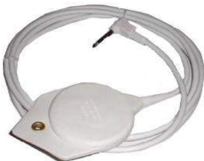
A-K3820-3M ST OR A-K3820-3M MONO