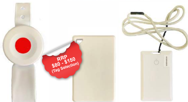
A-SAFELIFE WRIST, CLOTHING & ASSET TAGS