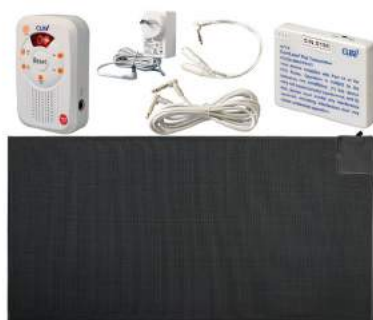
A-MAXI CL KIT