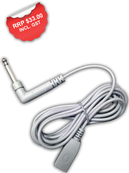
A-BREAKCORD-USB - T & R OR A-BREAKCORD-USB - T & S

USB to stereo 6.35mm jack plug (MONO) for connectivity from Cura1 hardwired floor mat to nurse call wall plate