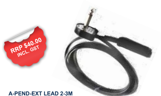
A-PEND-EXT LEAD 2-3M

Our standard connection is mono 6.35mm - If you require a different connection please advise our sales team