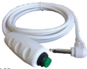
A-BARREL-GRIP-3M OR A-BARRELGRIP-5M