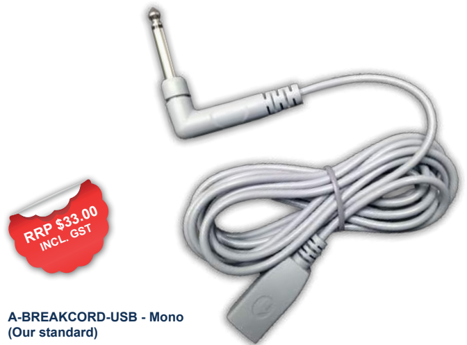
A-BREAKCORD-USB - Mono (Our standard)

Compatibility options available to suit all nurse call connection configurations – Please specify call point connection type on orders