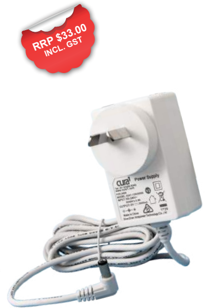
A-CBM & BME-PP

USB to RJ10 plug for connectivity from Cura1 hardwired floor mats and Pads to Cura1 Monitor.