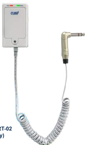
A-CL-MULTIPORT-02 (Facility use only)