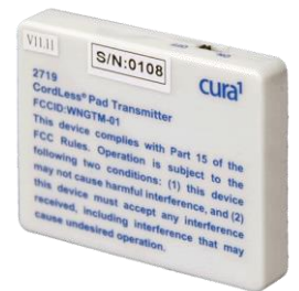
TRANSMITTER TO SEND OUT FALL ALERT

To find your nearest agent, Call Smart Caller on: (03) 9588 0833 or