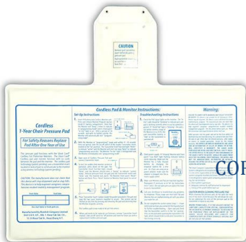
CORDLESS CHAIR PAD