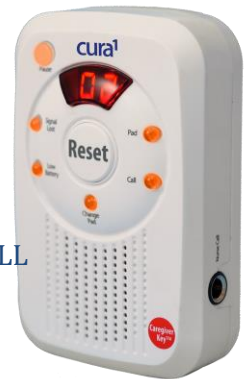
MONITOR TO RECEIVE FALL ALERT