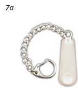
Fig 7a Rather than a carer pressing the reset button at an alarm, the care giver key is touched to the care giver key spot on the monitor fig 7c.

The care giver key is a great way to ensure a resident does not attempt to tamper with the monitor.